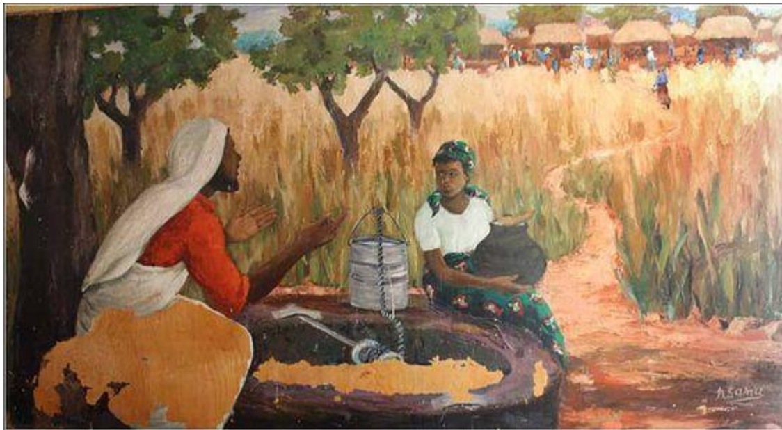
"Jesus and the Samaritan Woman", a life-size mural in the chapel of the Njase Girls Secondary School, Zambia. Painted by Emmanuel Nsama.