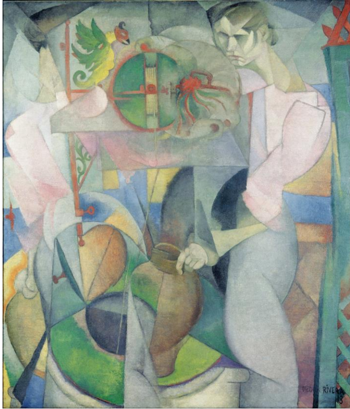
“Women at the Well” Painted by Diego Rivera.