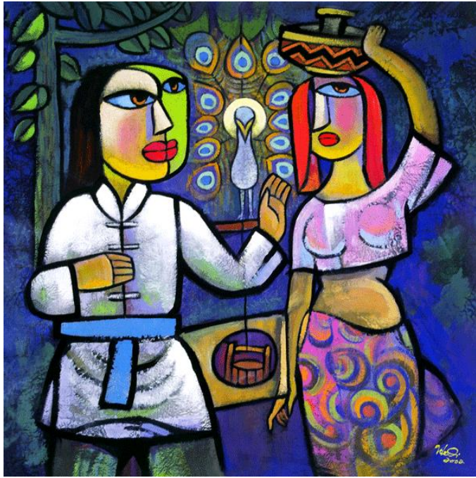
"Jesus and the Samaritan Woman" Painted by He Qi.